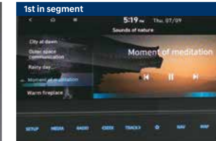
1st in segment Ambient sound of nature (7 nos.)