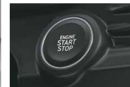
Push button start/stop