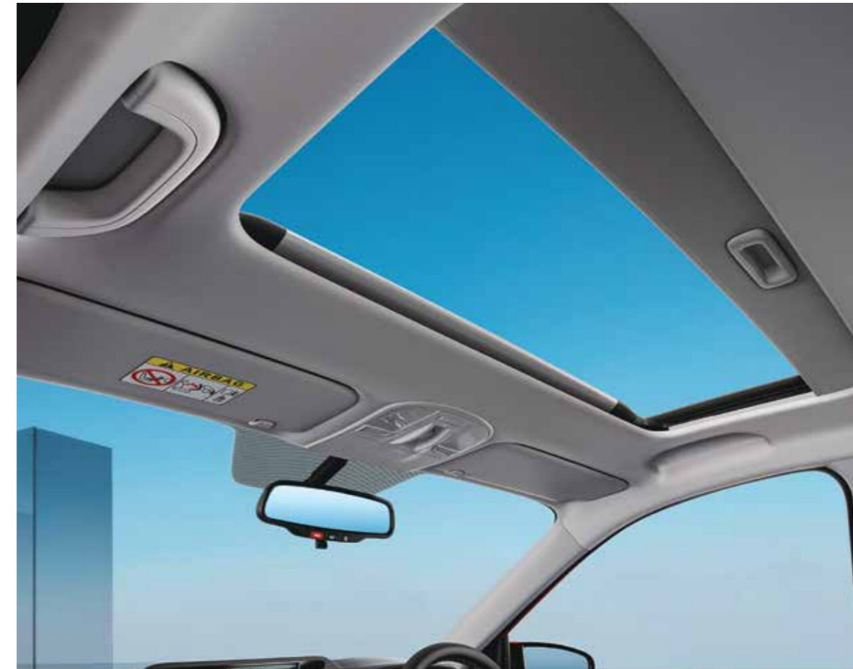
Voice enabled smart electric sunroof