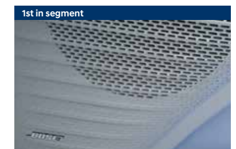
1st in segment Bose premium 7 speaker system

Other features: 60+ Bluelink connected features (Best in segment) | Multi-language UI support (12 nos.) (1 st in segment) | OTA updates for infotainment and map (1 st in segment) | Home to car (H2C) with Alexa (English & Hindi) | Cruise control | Rear AC vents | Multi phone bluetooth connectivity (1 st in segment)