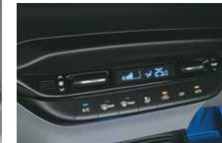
Fully automatic temperature control (FATC)