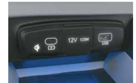
Fast USB charging (Type C)