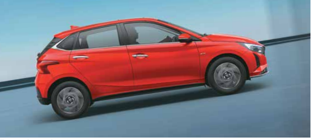
Hill-start assist control (HAC)