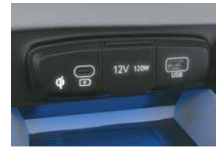
Fast USB charging (Type C)