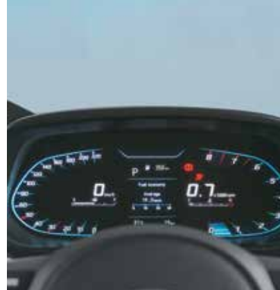
Digital cluster with TFT multi information display

Other features: Superior leg room and thigh support | Sliding front armrest | Leather wrapped steering wheel and gear knob | Metal finish inside door handles