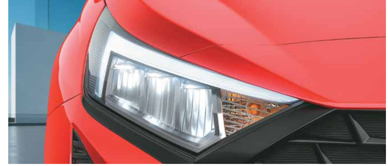
LED headlamps with signature DRLs