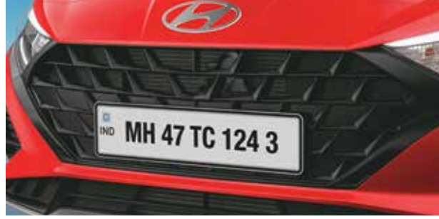
Parametric jewel pattern grille