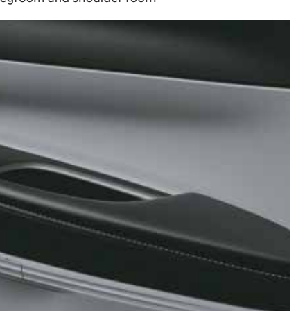
Door armrest covering (artificial leather)