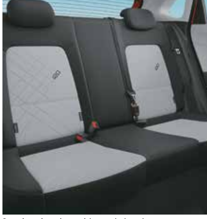
Spacious interiors with ample headroom, legroom and shoulder room