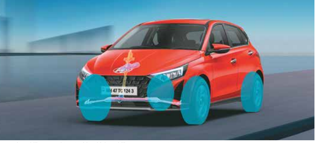
Electronic stability control (ESC) with vehicle stability management (VSM)

Other features: Impact sensing auto door unlock | Speed sensing auto door lock | Automatic headlamps | Burglar alarm | Driver rear view monitor (DRVM) | Emergency stop signal (1st in segment) 3-point seat belt & seat belt reminder (all seats) | Rear camera with dynamic guidelines | ISOFIX (standard)