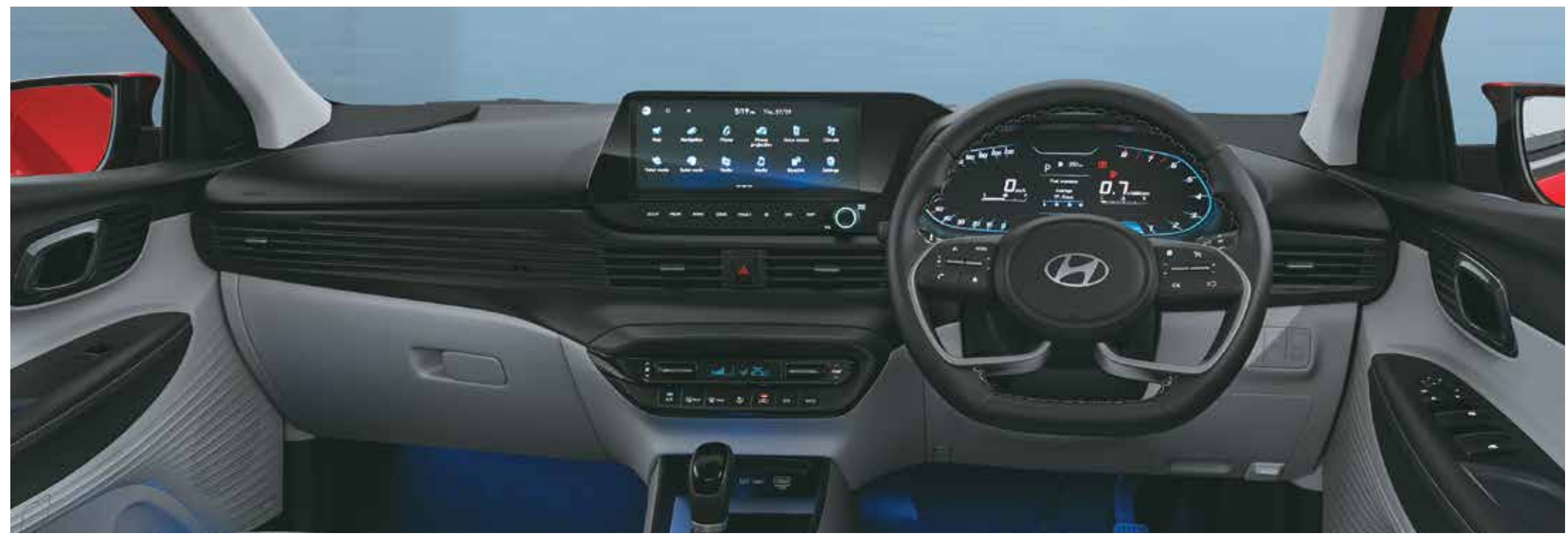
Dual tone black & grey interiors