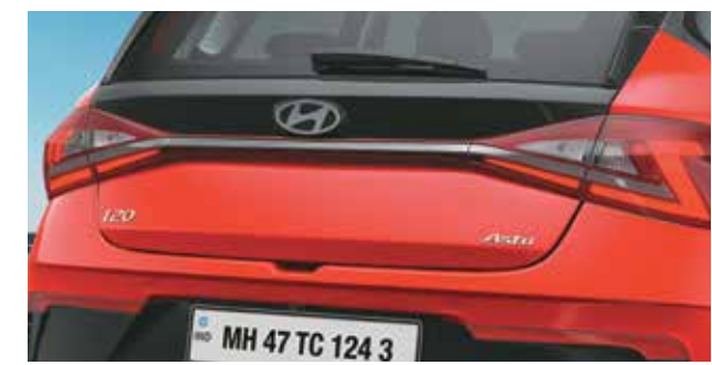
Stylish Z-shaped LED tail lamps