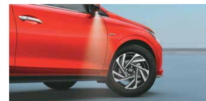
Puddle lamps with welcome function

Other features: Chrome outside door handles | Turn indicators on outside mirrors Painted black finish side sill garnish with i20 branding | Shark fin antenna