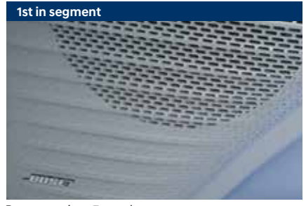
Bose premium 7 speaker system

Other features: 60+ Bluelink connected features (Best in segment) | Multi-language UI support (12 nos.) (1st in segment) | OTA updates for infotainment and map (1st in segment) Home to car (H2C) with Alexa (English & Hindi) | Cruise control | Rear AC vents | Multi phone bluetooth connectivity (1st in segment)