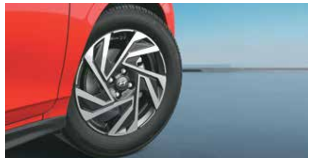
R16 (D=405.6 mm) diamond cut alloy wheels