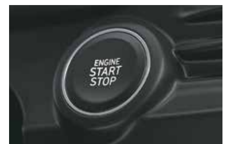
Push button start/stop