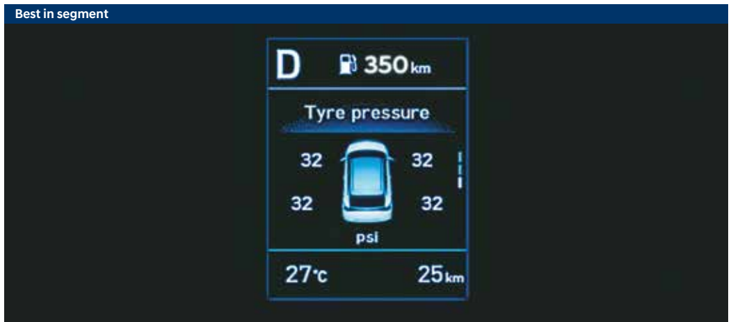
Tyre pressure monitoring system (highline) with display on MID

The new Hyundai i20 ensures you drive safe wherever you go. It comes equipped with advanced safety features that are a cut above the rest. 6 airbags for maximum protection. Electronic stability control (ESC) with vehicle stability management (VSM) and emergency stop signal (ESS) ensure that you always drive stress free.