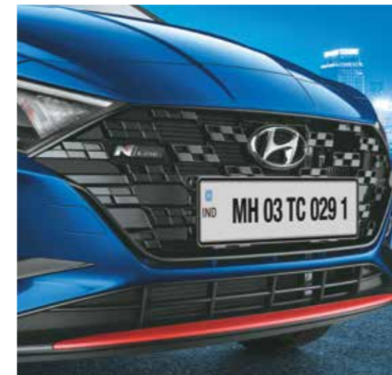
Chequered flag inspired front grille

Images are for creative purposes only. Please do not imitate. Hyundai encourages safe driving practices.