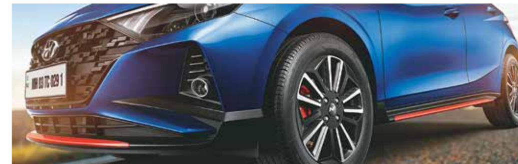
Athletic red highlights* (front skid plate & side sill garnish)

Sporty and breathtakingly stunning, the Hyundai i20 N Line commands attention everywhere it goes with its WRC inspired sporty new design. Its exciting new athletic design and playful details set you apart from the crowd in a field of lookalikes.