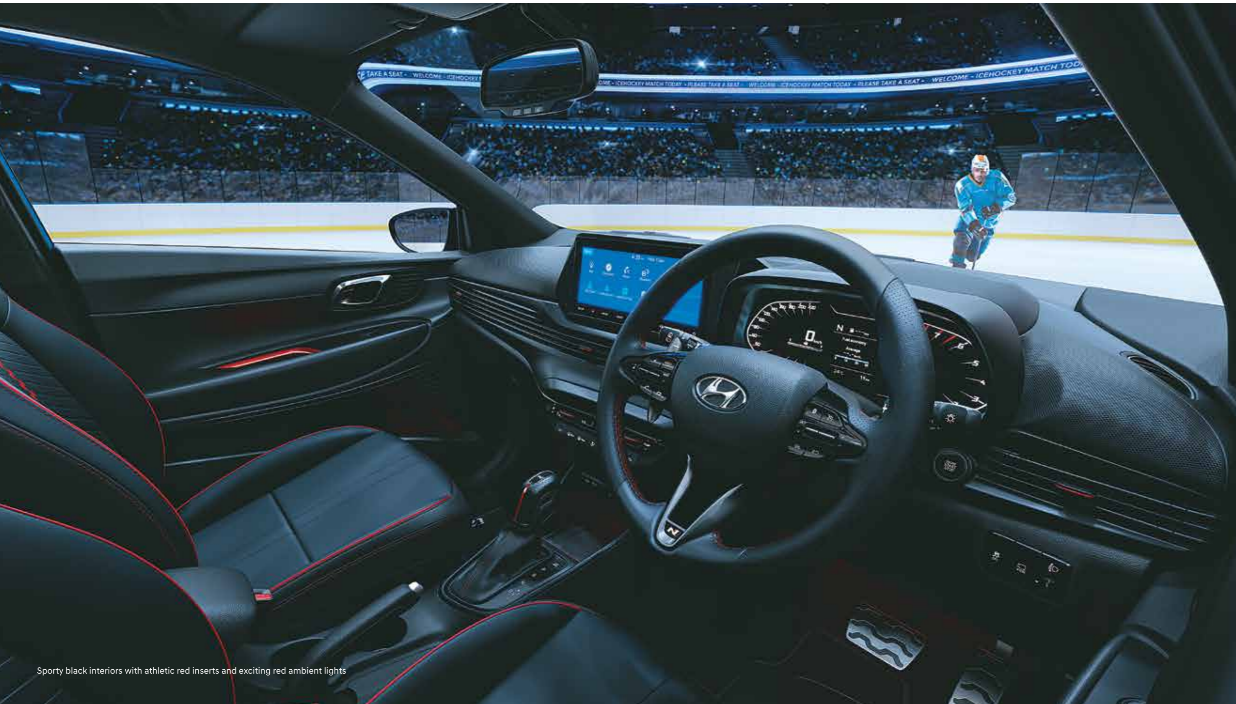
Sporty black interiors with athletic red inserts and exciting red ambient lights