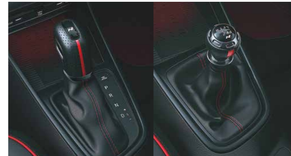
Perforated leather* wrapped gear knob with N logo (7 DCT & iMT)