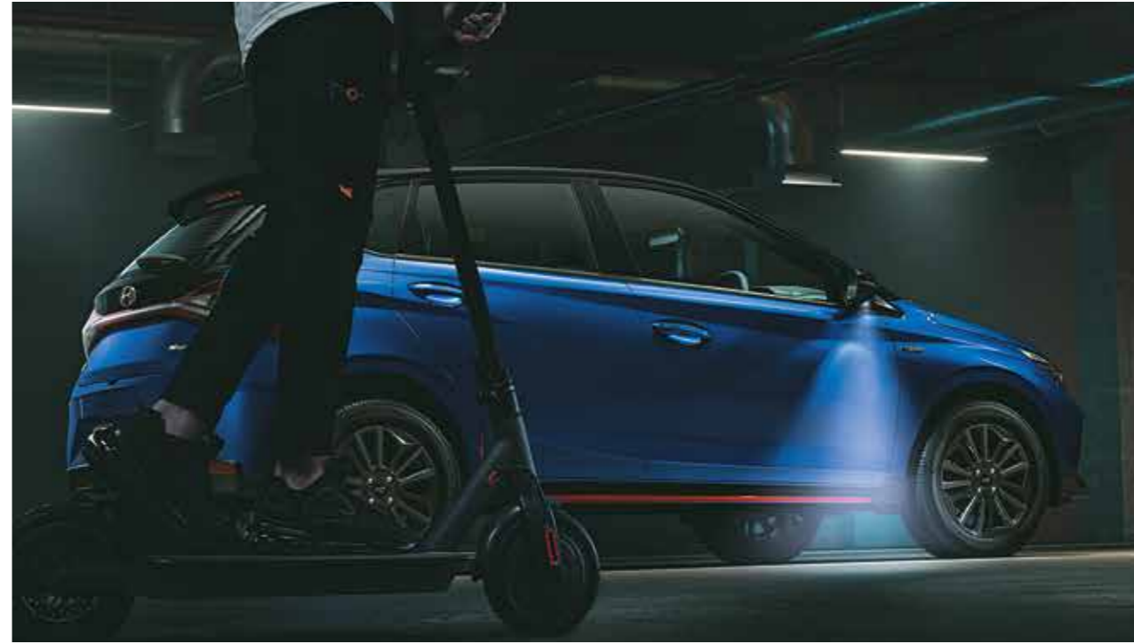
Puddle lamps with welcome function