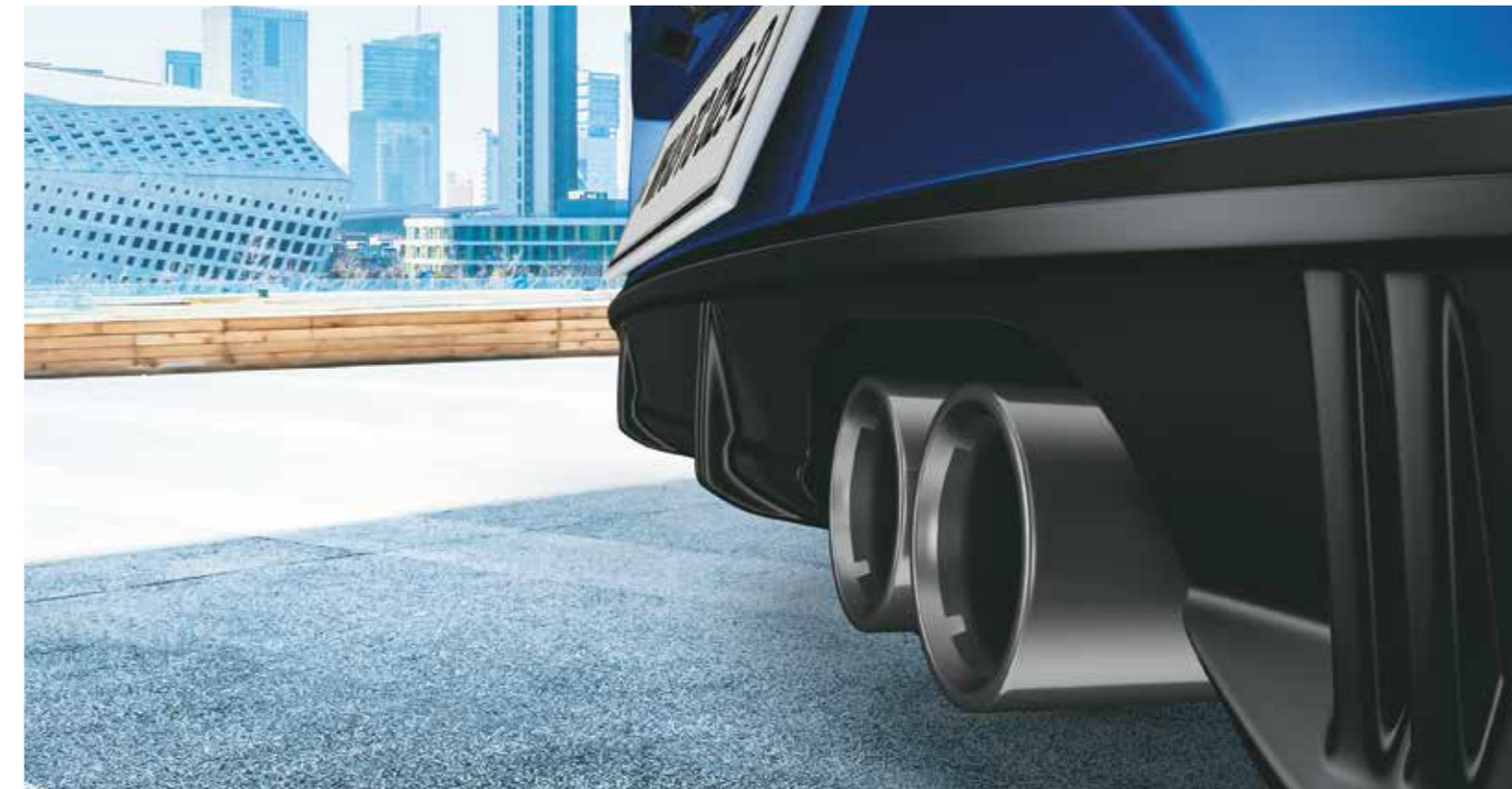
Twin tip muffler