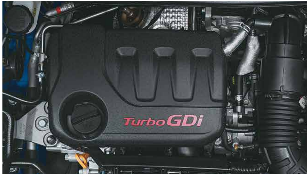
1.0 l Turbo GDi petrol engine with max. power of 88.3 kW (120 PS) / 6 000 r/min