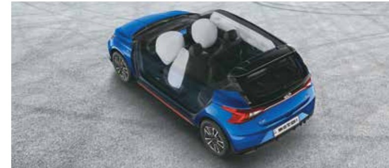
Driver, passenger, side & curtain airbags