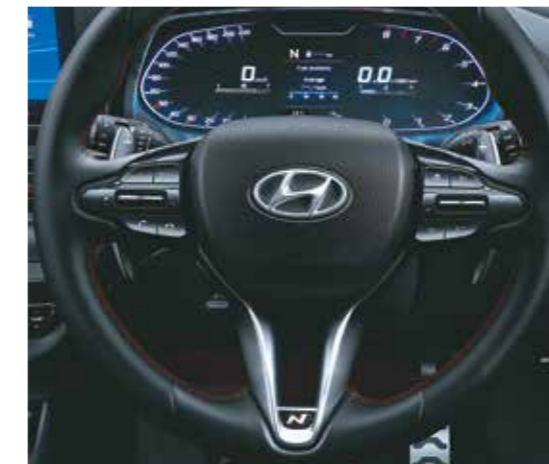
3-spoke steering wheel with N logo

With Over-the-Air (OTA) map updates* 3 years free Bluelink subscription