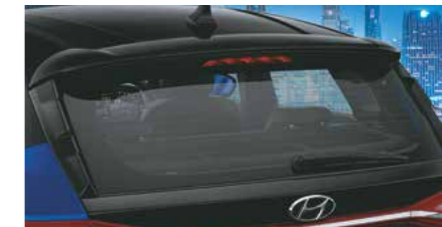
Sporty tailgate spoiler with side wings

Other features – LED projector headlamps with LED day time running lamps (DRL) | Dark chrome connecting tail lamp garnish Front fog lamp chrome garnish