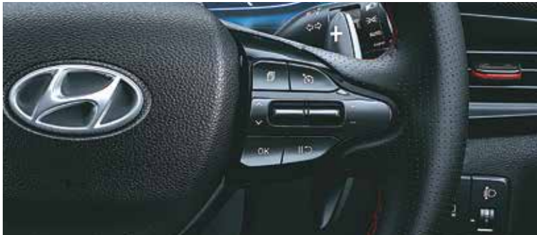
Paddle shifters (DCT only)