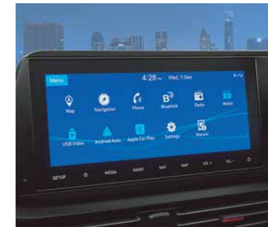
26.03 cm (10.25") HD touchscreen infotainment & navigation system