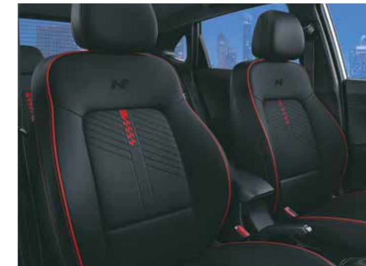
Chequered flag design leather* seats with N logo