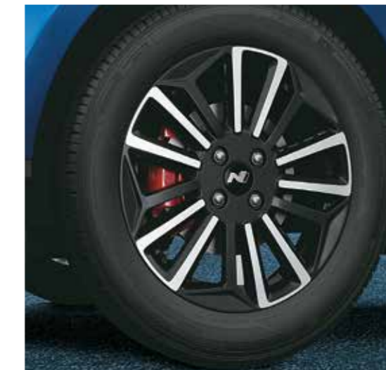
R16 (D=405.6mm) diamond cut alloy wheels with N logo and front disc brakes with red caliper