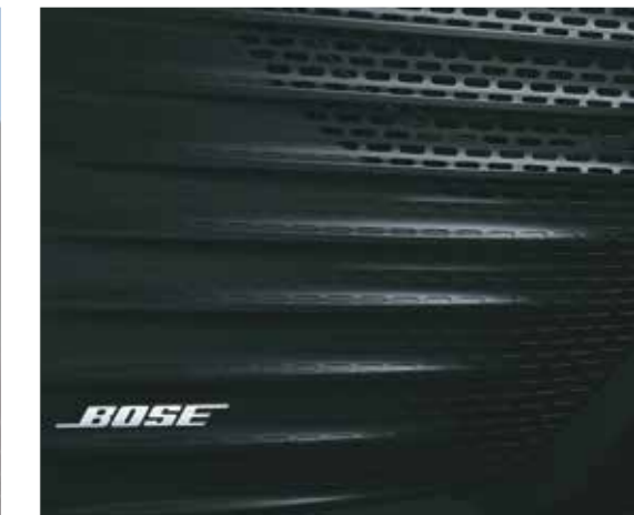
Bose premium 7 speaker system

Other features – Wireless charger with cooling pad | Digital cluster with TFT multi information display (MID)