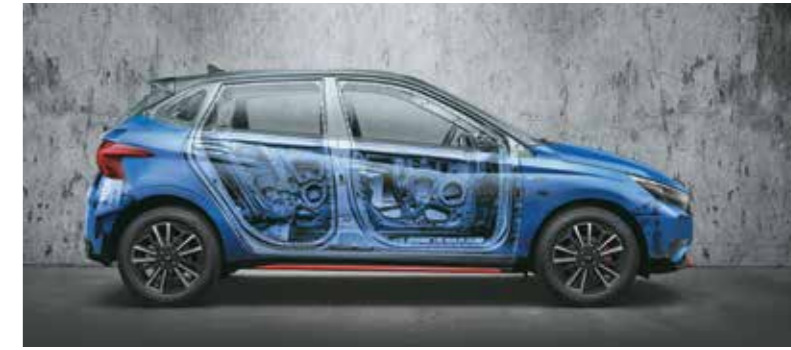
Strong body structure with AHSS & HSS