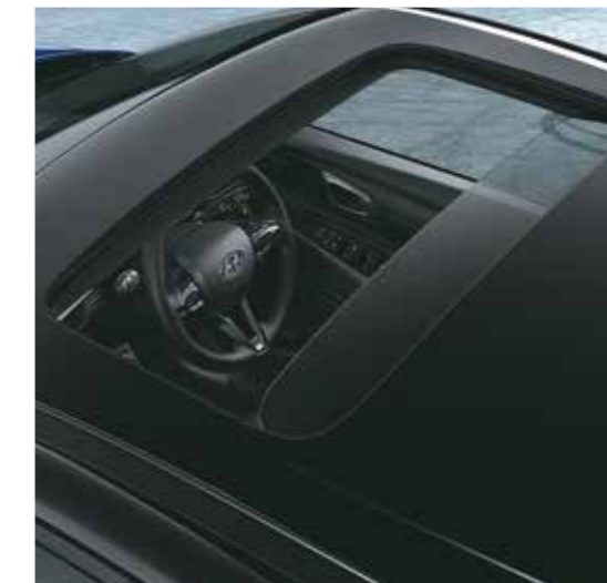
Voice enabled smart electric sunroof