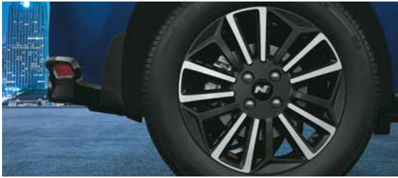
Rear disc brakes