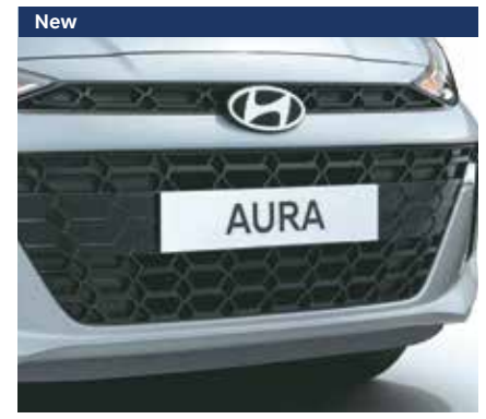
Painted black radiator grille

The new Hyundai AURA makes an impression from every angle you look at it. The new painted black grille and LED DRLs give it an unmistakable presence and command on the road.