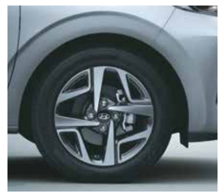
R15 (D = 380.2 mm) Diamond cut alloy wheels