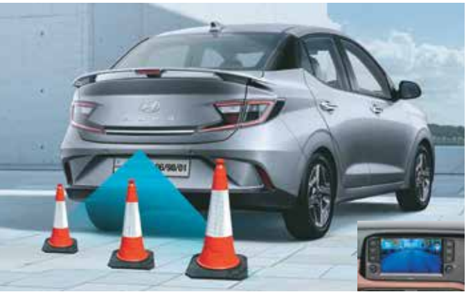
Rear parking camera with display on audio