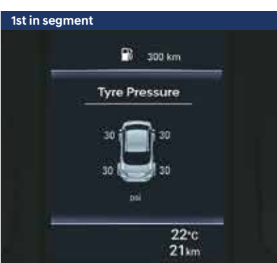
Tyre pressure monitoring system-highline