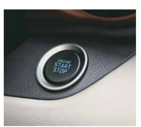
Smart key with push button start/stop