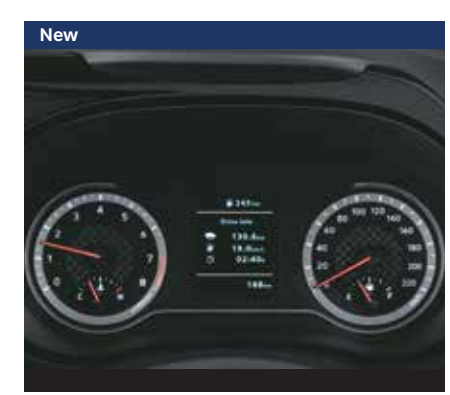
8.89 cm (3.5") Speedometer with multi information display