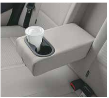
Rear centre armrest with cup holder

Superior cabin space with ample legroom and thigh support