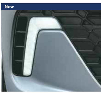
LED daytime running lamps (DRLs)