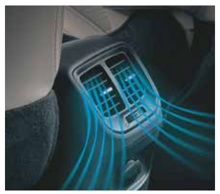
Rear AC vent