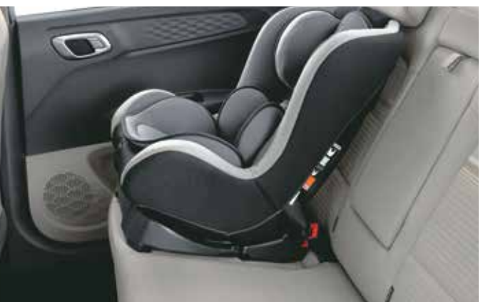
Child seat anchor (ISOFIX)