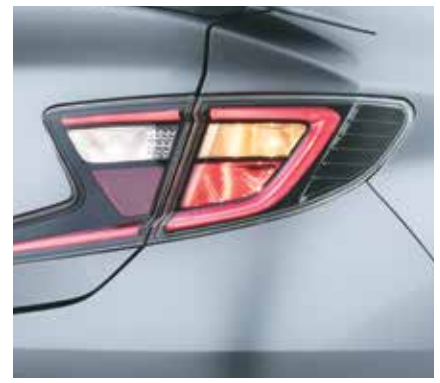
Stylish Z shaped LED tail lamps