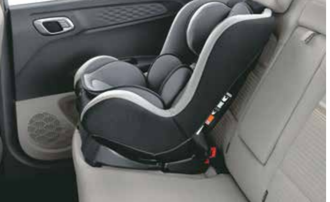
Child seat anchor (ISOFIX)

Other features: Speed sensing auto door lock | Impact sensing auto door unlock | Emergency stop signal (1 st in segment)