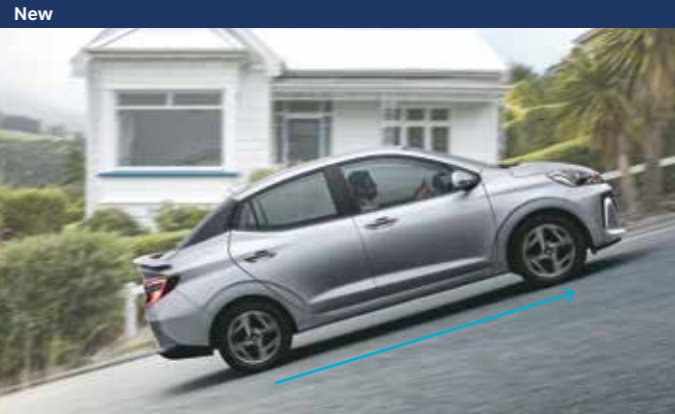
Hill-start assist control (HAC)