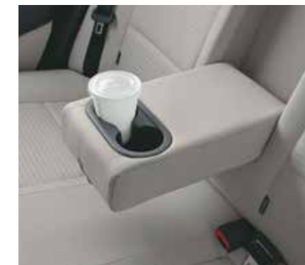
Rear centre armrest with cup holder