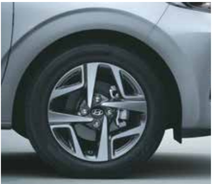
R15 (D = 380.2 mm) Diamond cut alloy wheels