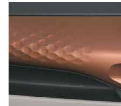
Premium honeycomb patterned crashpad