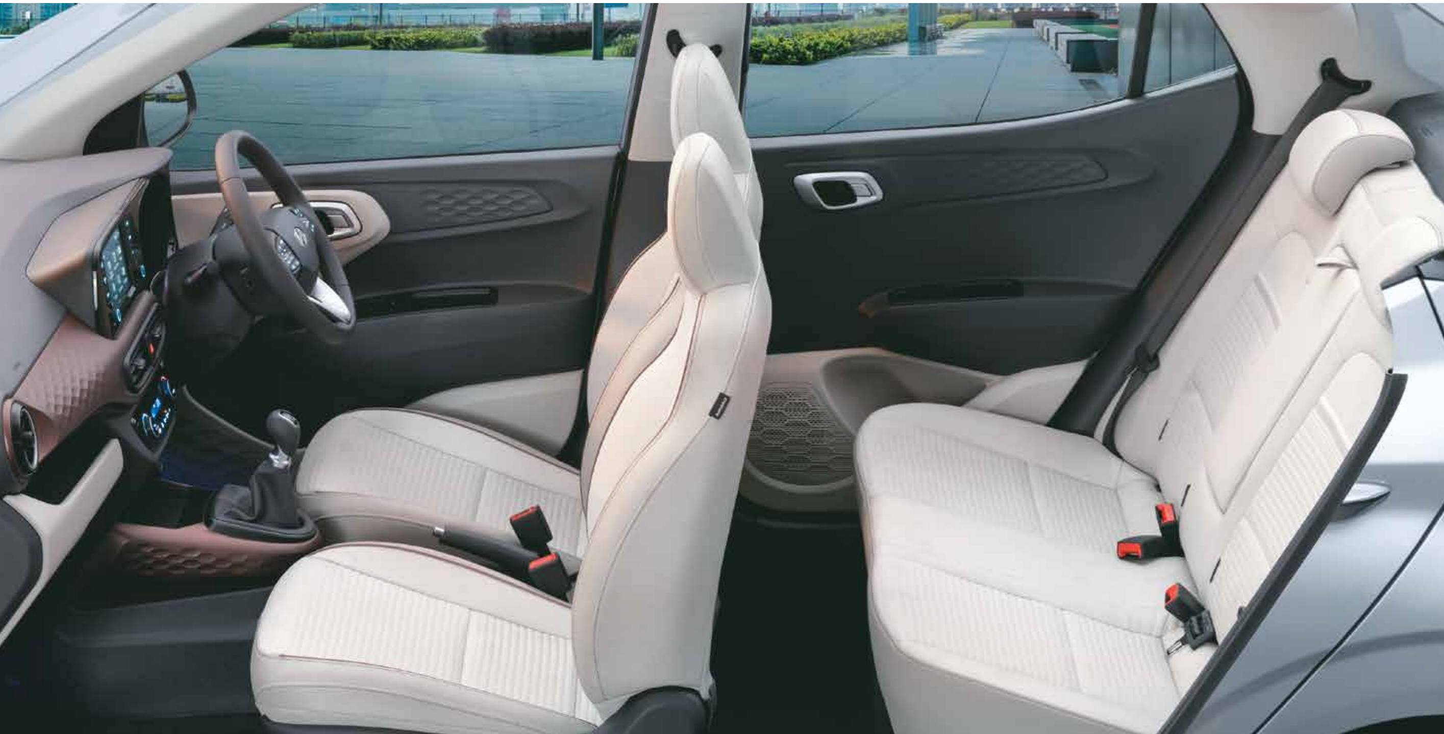
Dual tone grey interiors