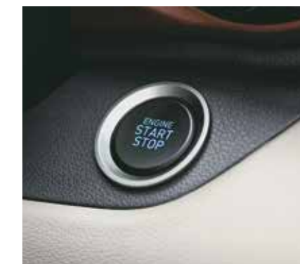
Smart key with push button start/stop