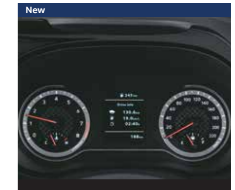
8.89 cm (3.5") Speedometer with multi information display