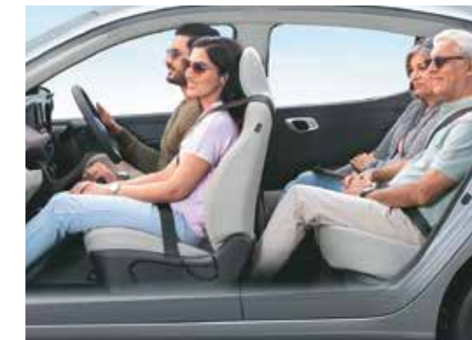
Superior cabin space with ample legroom and thigh support