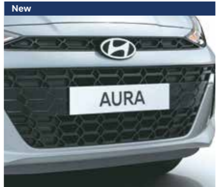
New Painted black radiator grille

The new Hyundai AURA makes an impression from every angle you look at it. The new painted black grille and LED DRLs give it an unmistakable presence and command on the road.