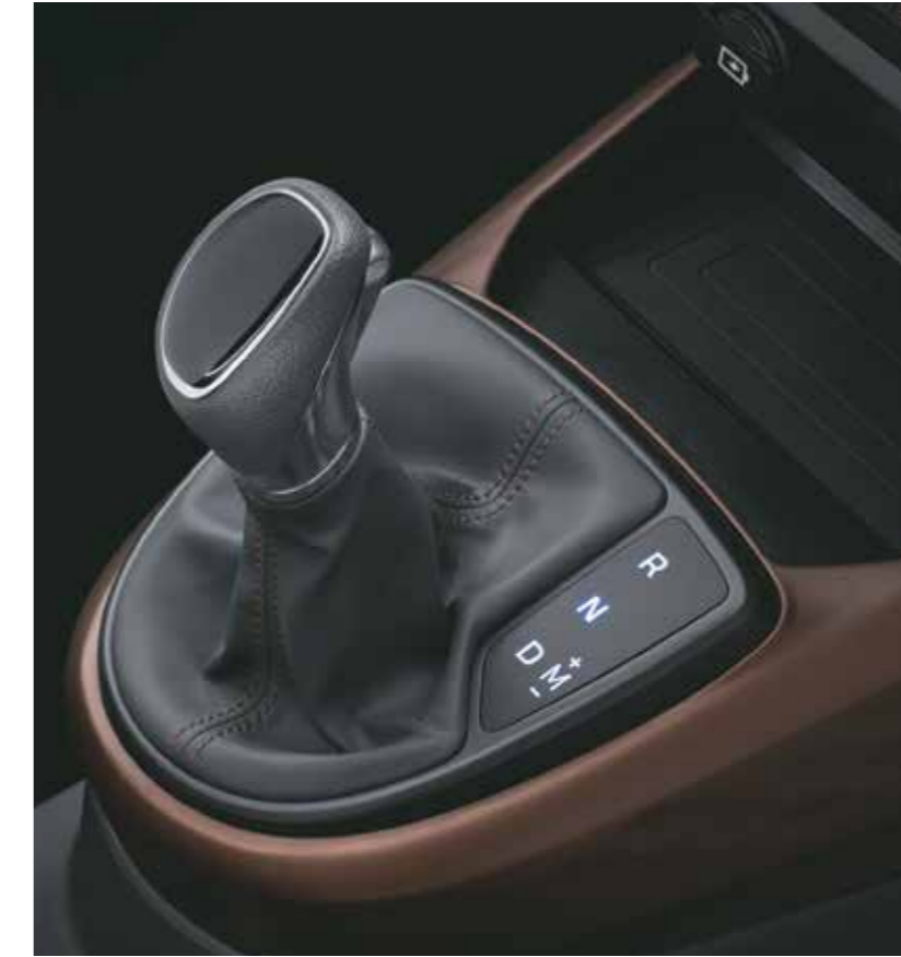
Automated manual transmission (AMT)