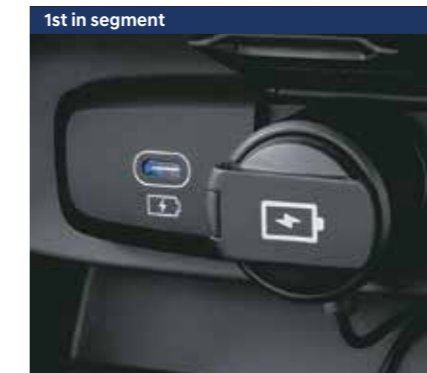
1st in segment

The interior of the new Hyundai AURA combines modern aesthetics with contemporary craftsmanship. It is meticulously designed to optimise the space to give the occupants more room and make long journeys as comfortable as short hops across the city.