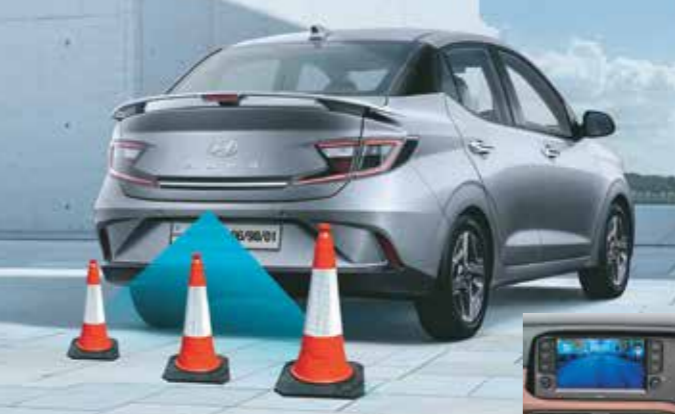
Rear parking camera with display on audio