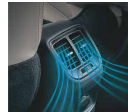
Rear AC vent