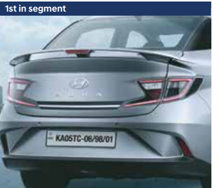
1st in segment Rear wing spoiler