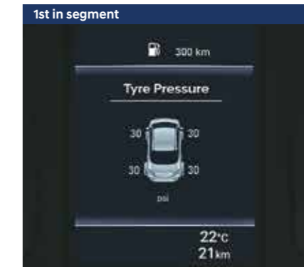
Tyre pressure monitoring system-highline