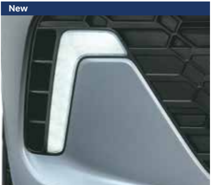
New LED daytime running lamps (DRLs)