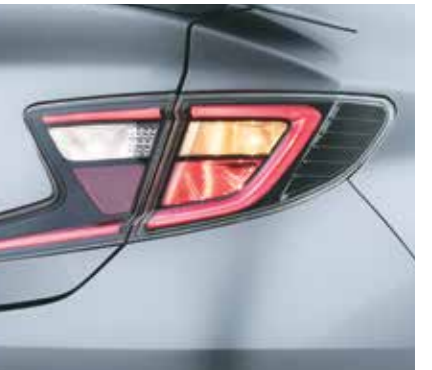
Stylish Z shaped LED tail lamps

Other features: Rear chrome garnish | Chrome outside door handles | Turn indicators on outside mirrors | Shark fin antenna