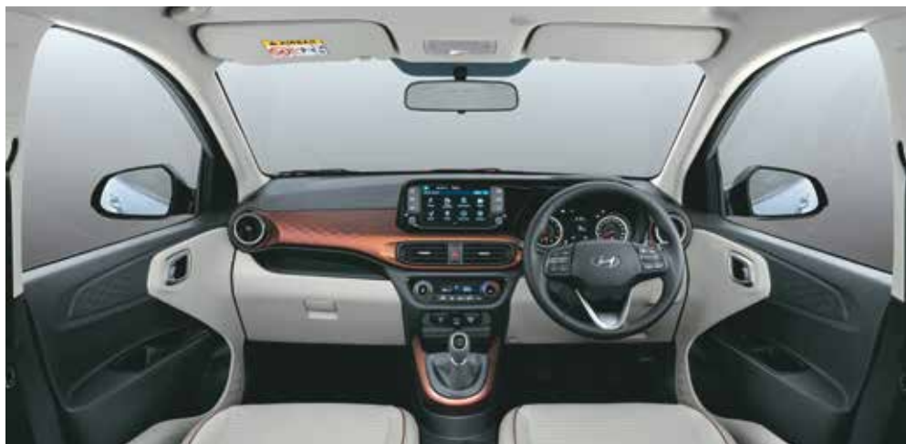
Dual tone grey interior