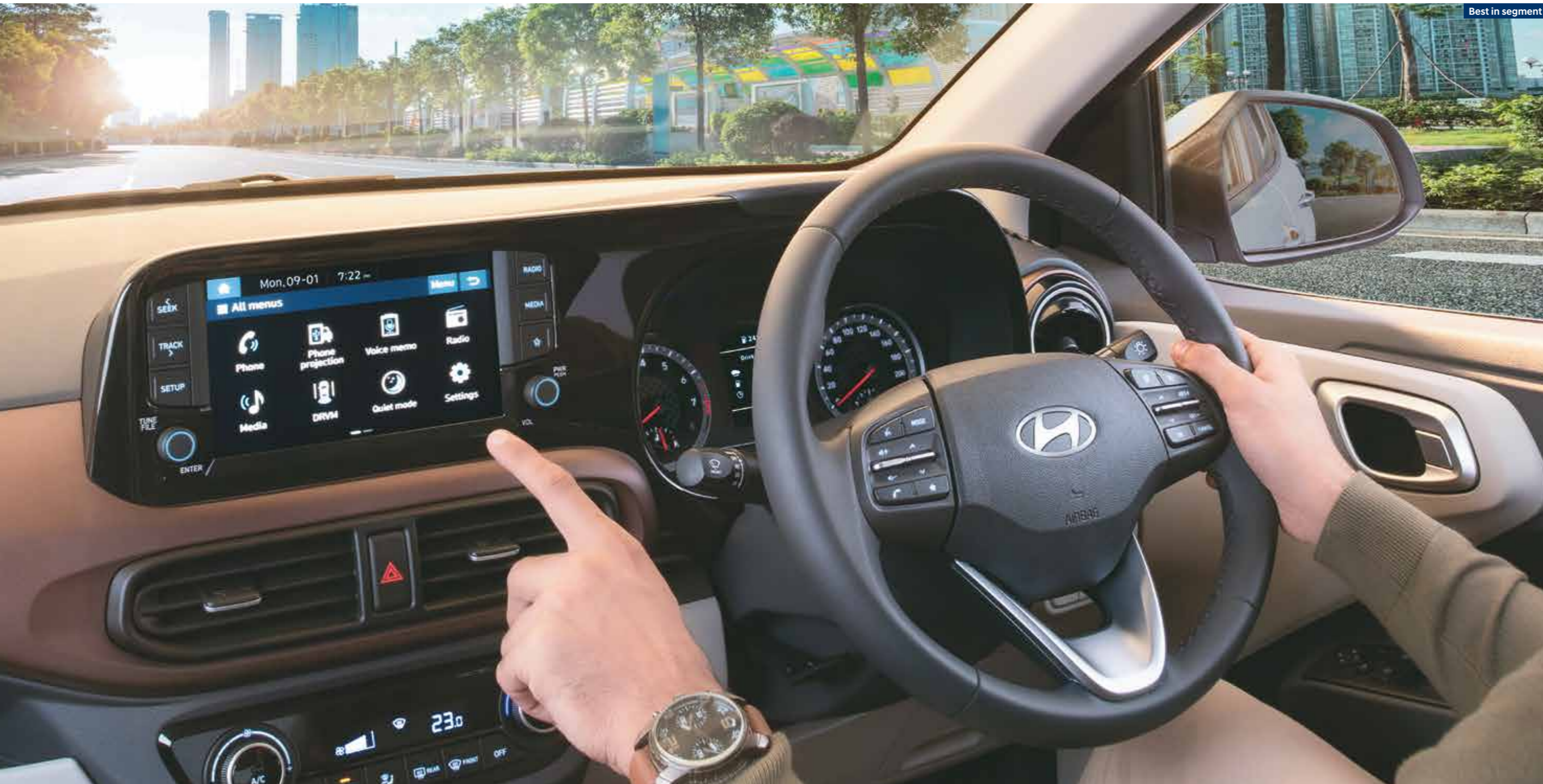
20.25 cm (8") Touchscreen display audio with smartphone connectivity*