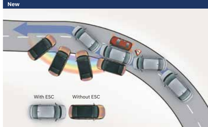
Electronic stability control (ESC) & Vehicle stability management (VSM)