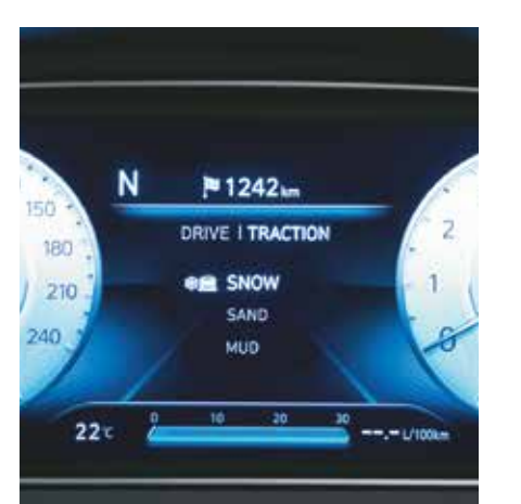
Traction control modes