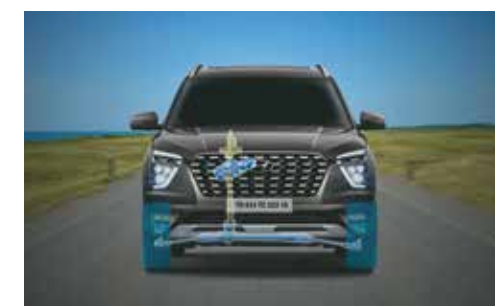
Vehicle stability managment (VSM)