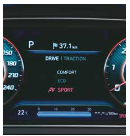
Drive mode select