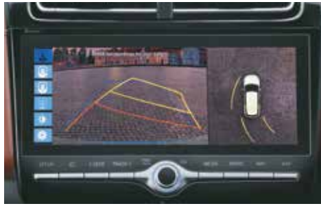
Surround view monitor (SVM)