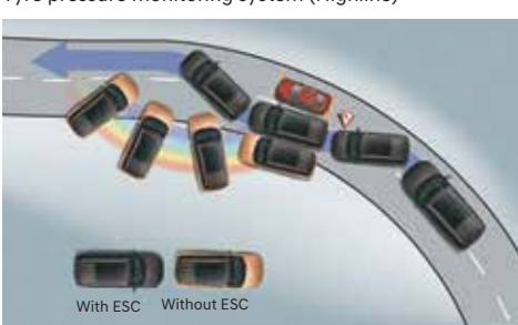
Electronic stability control (ESC)