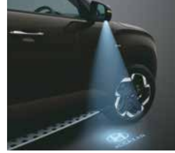
Puddle lamps with logo projection