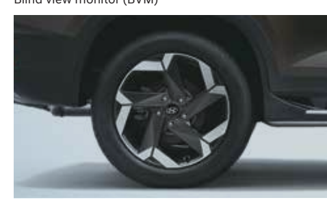
Rear disc brakes