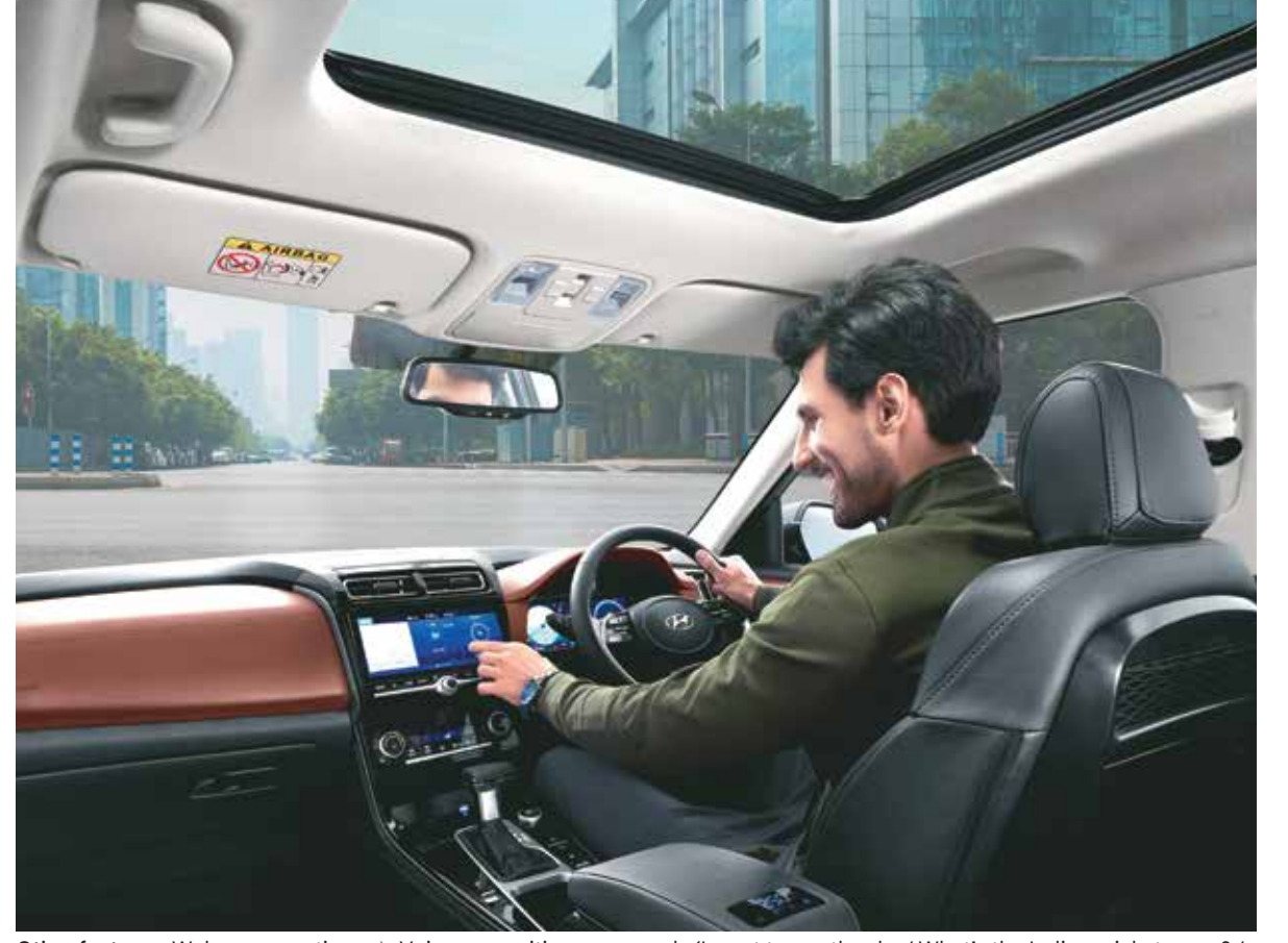
Other features: Welcome greetings | Voice recognition commands (I want to see the sky / What's the Indian cricket score? / When is the soccer match?) | Bluelink integrated smartwatch app

We've created technology to serve you and make your life easier, intuitively and simply. Stay seamlessly connected with your Hyundai ALCAZAR and the world, with Bluelink. The Hyundai ALCAZAR offers outstanding capability on and off the road. Choose between driving modes for everyday driving or traction modes for any terrain you need to conquer.