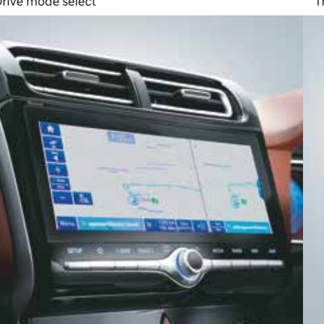
Advanced Bluelink with OTA map updates