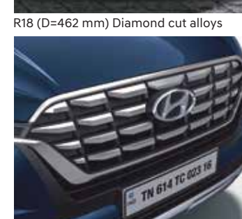
Dark front chrome grille*