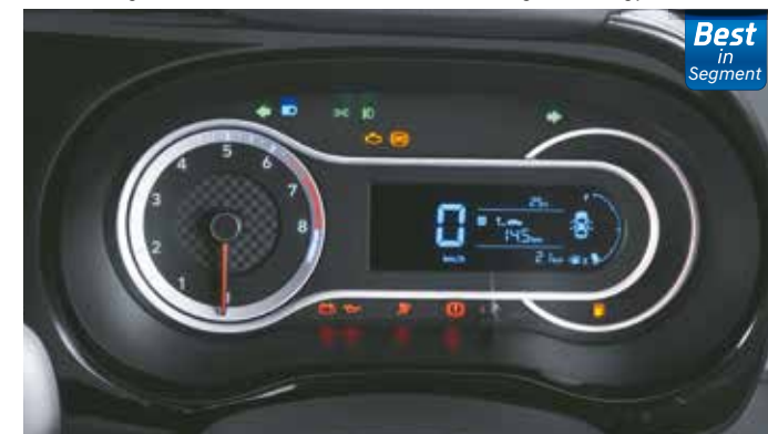
13.46 cm Digital Speedometer