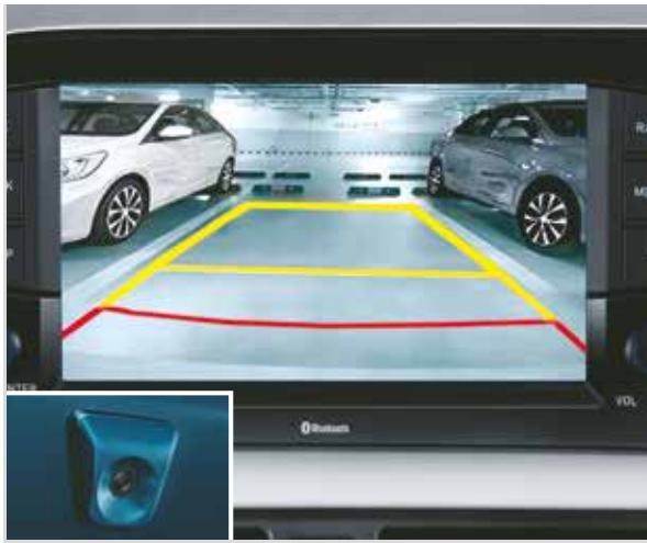
Rear Parking Camera with Display on 20.25 cm Screen

Speed Alert System | Front Seatbelt Pretensioner with load limiters | Rear Defogger Impact Sensing Auto Door Unlock / Speed Sensing Auto Door Lock | Headlamp Escort Function