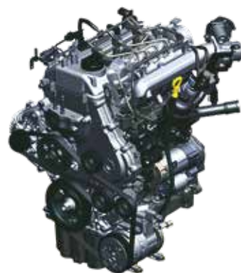
1.2 U2 CRDi Diesel Engine