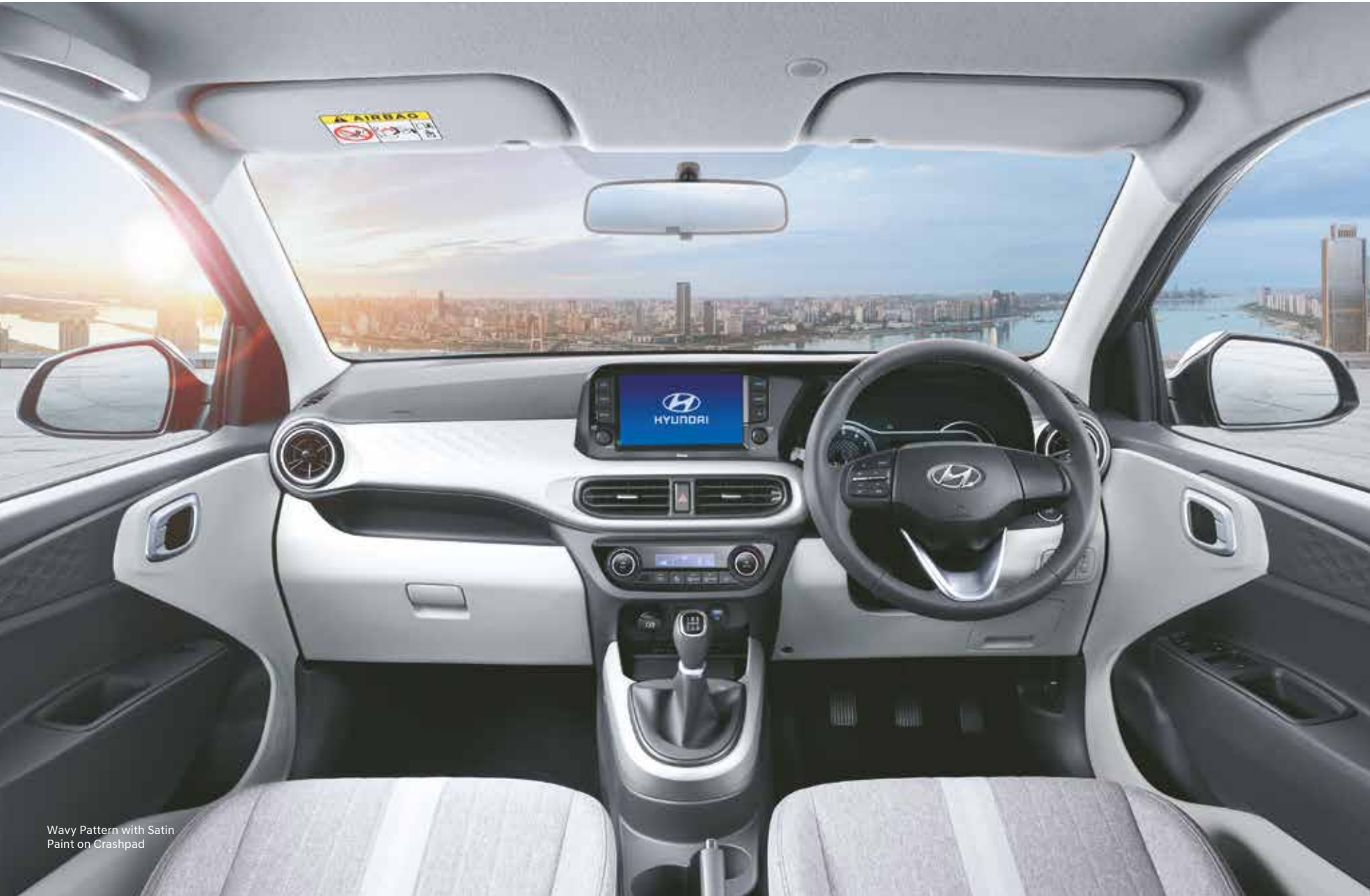
Wavy Pattern with Satin Paint on Crashpad