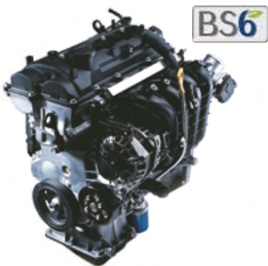
1.2 Kappa Dual VTVT BS6 Petrol Engine

The new BS VI compliant petrol engine in the All New GRAND i10 NIOS makes it a pleasure to drive. So, grab the wheel and get set for a matchless experience. You can also opt for the convenient AMT version in Petrol or Diesel.