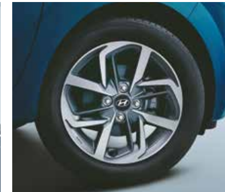
R15 Diamond-cut Alloy Wheels