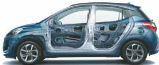
Strong Body Structure-65% (AHSS + HSS)