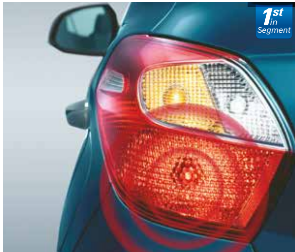
Emergency Stop Signal