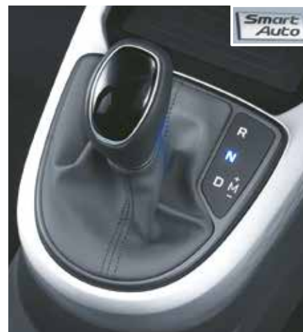
AMT in Petrol & Diesel