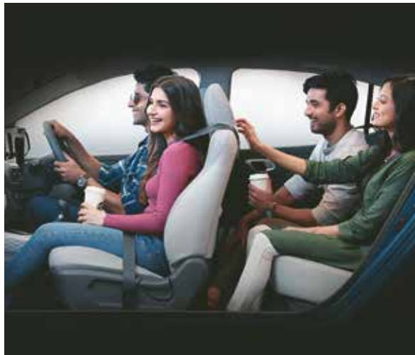
Wide and Spacious Cabin