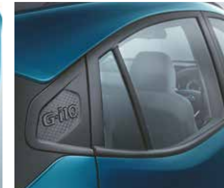
Unique Gi10 Branding on C Pillar