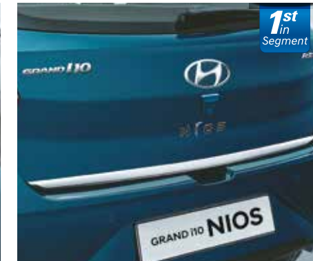
Rear Chrome Garnish

Roof Rails | Air Curtain | Sporty Rear Skid Plate | Turn Indicators on Outside Mirrors