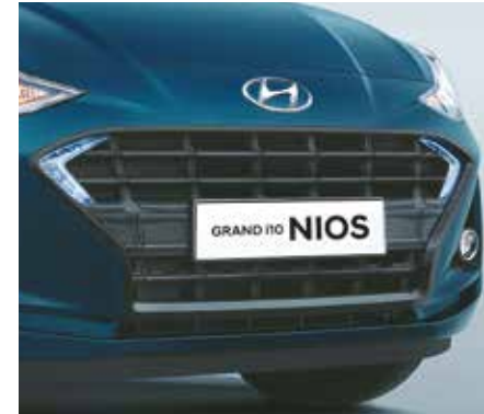
Glossy Black Radiator Grille*

Admire it from any angle, and The All New GRAND i10 NIOS will catch your eye with its bold stance and contemporary design. Check out its new Projector Headlamps & Foglamps for enhanced visibility. Body Coloured Bumpers, Chrome Door Handles and Blacked out B-Pillar & Window Line give it a differentiated road presence.