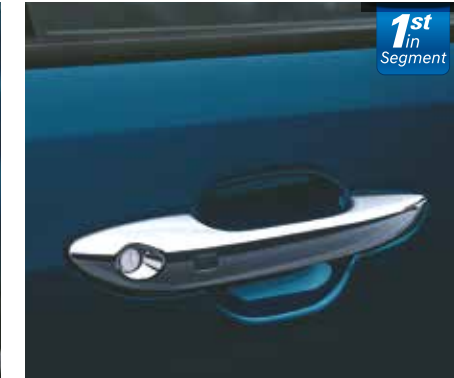
Chrome Door Handles