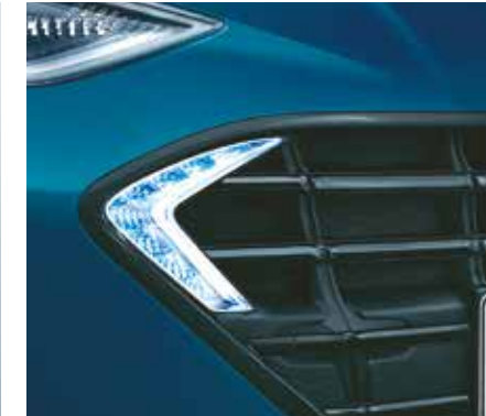
Boomerang Shaped LED DRLs