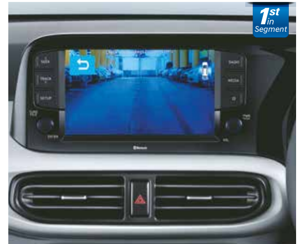
Driver Rear View Monitor