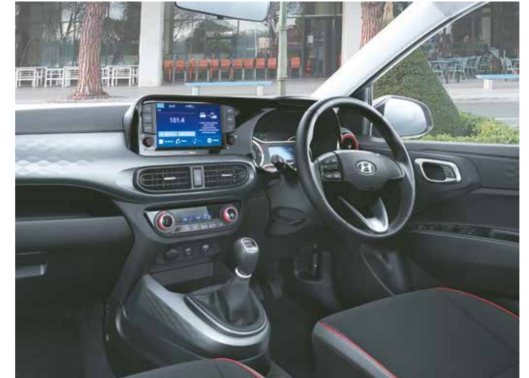
Dual Tone Interior Option

The All New GRAND i10 NIOS gets its smart technology from the Hyundai stable; like the Best-in-segment 20.25 cm Touchscreen Infotainment System with Smartphone Connectivity. Advanced technology is always working behind the scene to make every drive a convenient yet richly immersive experience.