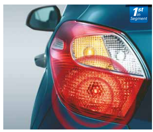
Emergency Stop Signal