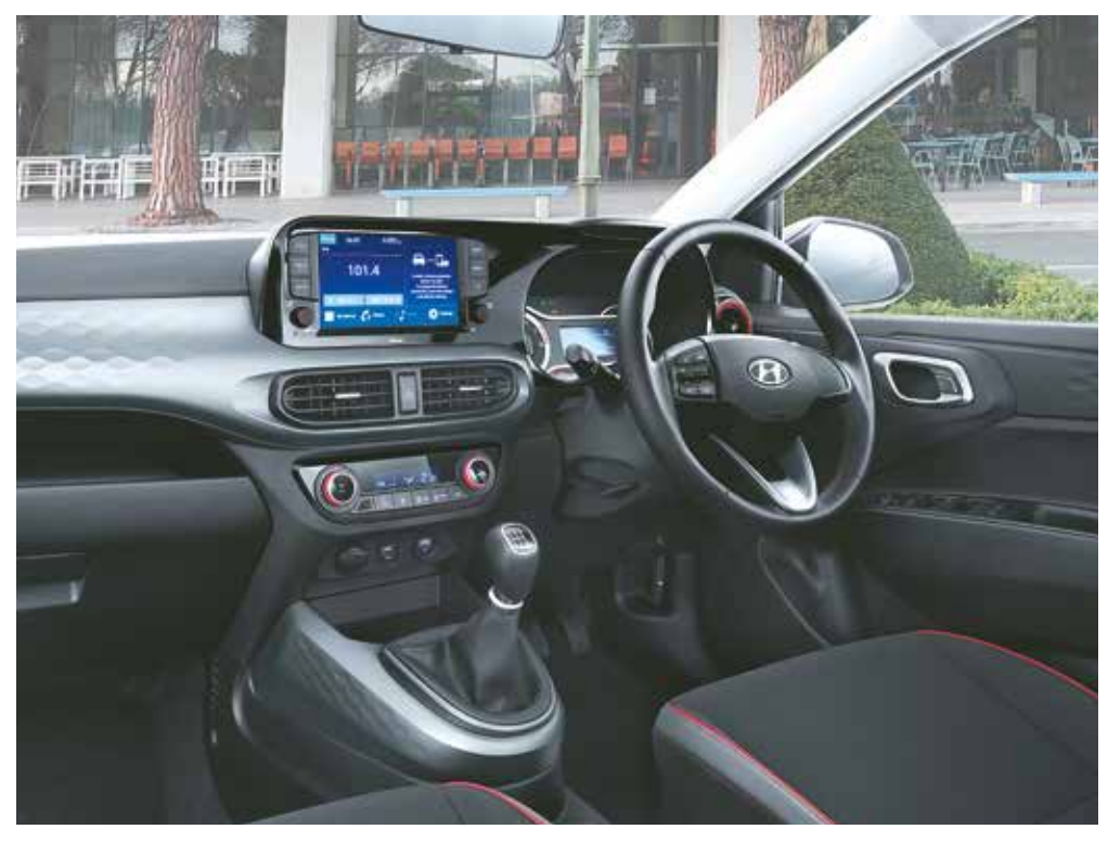
Dual Tone Interior Option

The All New GRAND i10 NIOS gets its smart technology from the Hyundai stable; like the Best-in-segment 20.25 cm Touchscreen Infotainment System with Smartphone Connectivity. Advanced technology is always working behind the scene to make every drive a convenient yet richly immersive experience.