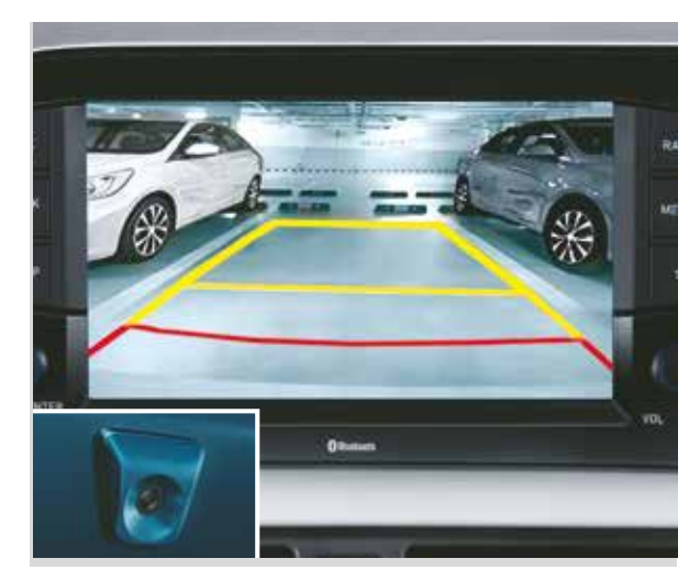
Rear Parking Camera with Display on 20.25 cm Screen

Impact Sensing Auto Door Unlock / Speed Sensing Auto Door Lock | Headlamp Escort Function