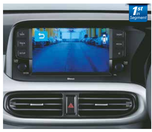
Driver Rear View Monitor