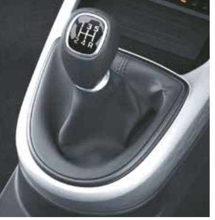
AMT in Petrol & Diesel