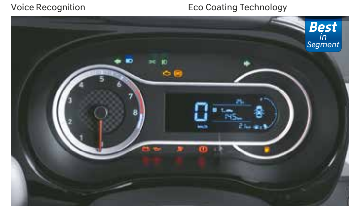
13.46 cm Digital Speedometer